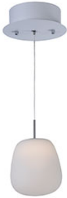
E21121-11WT Puffs 1-Light Pendant