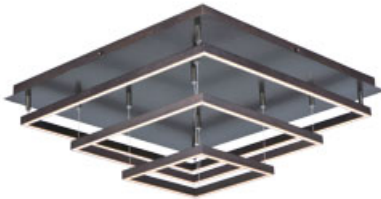
E22408-BZ Quad LED Flush Mount