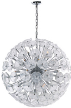
E22096-28 Cassini 28-Light Pendant