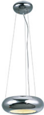
E22591-PC Donuts 1-Light LED Pendant