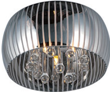
E21399-81PC Sense II 3-Light Flush Mount