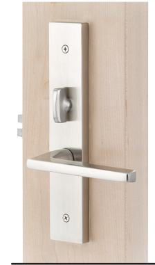
Interior trim view

To order: Function + Product Code + Backset + Knob/Lever Style + Handing + Finish + Add Door Thickness to Comments