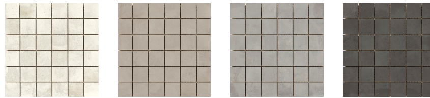
White 2"x2" on 12"x12" Mesh Beige 2"x2" on 12"x12" Mesh Gray 2"x2" on 12"x12" Mesh Black 2"x2" on 12"x12" Mesh

All Diagonal Colors are Available in Left & Right