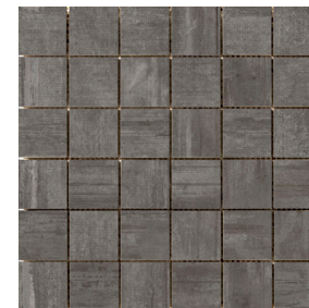
Ash 2"x2" on 12"x12" Mesh