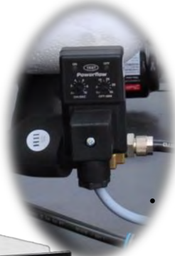
• Auto Drain system - eliminates the need for daily maintenance