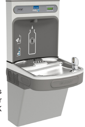
Models F7S8WSVRI K or EZSDWSVRLK