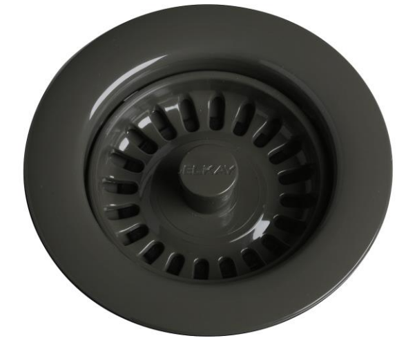
AMERICAN PRIDE. A LIFETIME TRADITION. Like your family, the Elkay family has values and traditions that endure. For almost a century, Elkay has been a family-owned and operated company, providing thousands of jobs that support our families and communities.