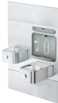
Shown with two optional access panels installed

Warranty: Electrical components and water system are warranted for 12 months from date of installation or 18 months from factory shipment, whichever date falls first.