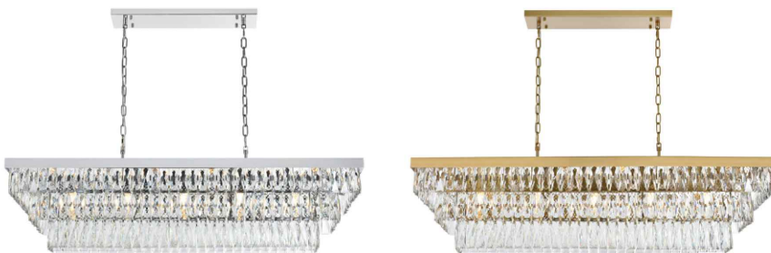
Chrome Item No: 1060G48C