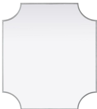
Item No:MR3D3036SIL (Silver)