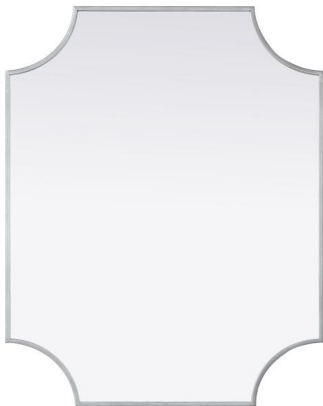
Item No:MR3D2736IL (Silver)