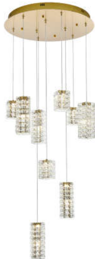
Satin Gold Item No:3680D9SG