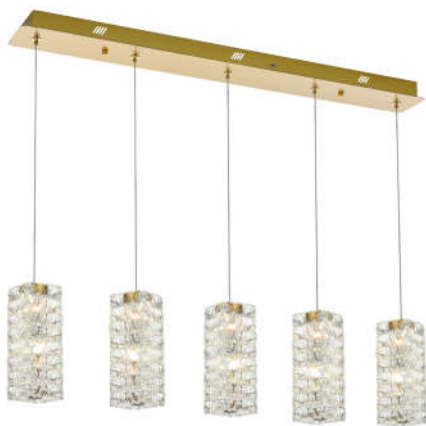
Satin Gold Item No:3680D3RSG