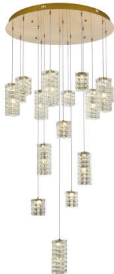
Satin Gold Item No:3680D32SG