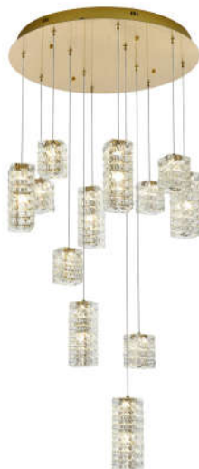
Satin Gold Item No:3680D28SG