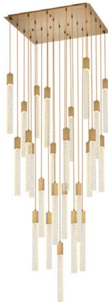
Stain Gold Item No: 2066G36SG