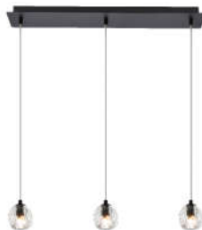
Black Item No:3505D28BK