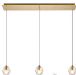
Gold Item No:3505D28G