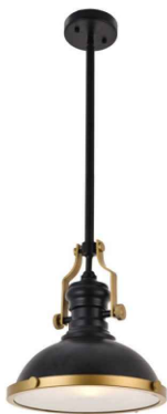
Brass & black Item No:LD5001D13BRB