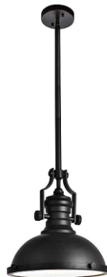
Oil Rubbed Bronze Item No:LD5001D13ORB