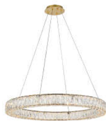
Gold Item No:3503D31G