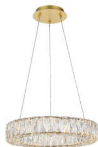
Gold Item No:3503D17G