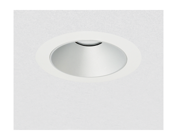
Compatible Trims: Compatible with 4" Pex Trims.