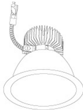
Reflector Trim E810L