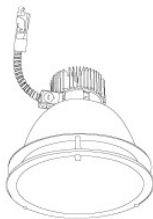
Drop Glass Trim E812L