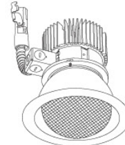
Round Wall Wash Trim E411L