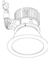
Round Reflector Trim E410L