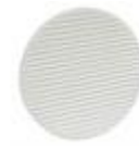
L46 - Linear