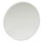
L47 - Spread