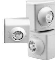
LZR remote heads (sold separately)