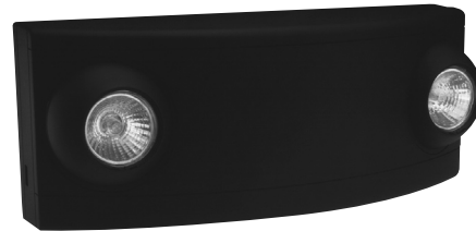
Optional black finish