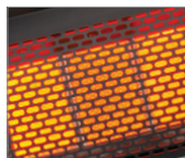
4-tile commercial ceramic burner