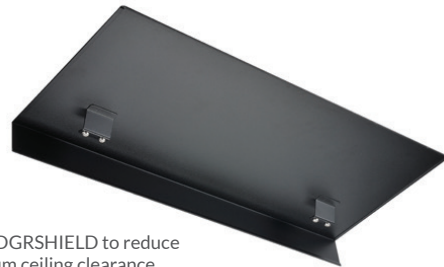
Order DGRSHIELD to reduce minimum ceiling clearance