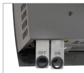
Electronic finger pull for easy ignition and turn-off