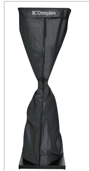
Order TGHCOVER for storage