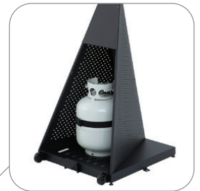
Fully concealed propane tank