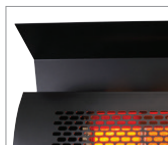
Protective grille and reflector included