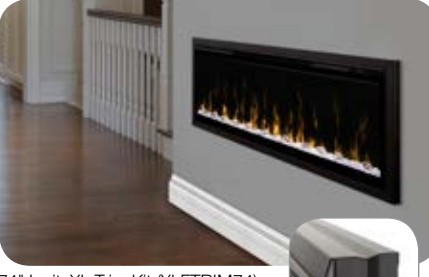
74" IgniteXL Trim Kit (XLFTRIM74) Allows installation of IgniteXL in 2"x4" wall construction