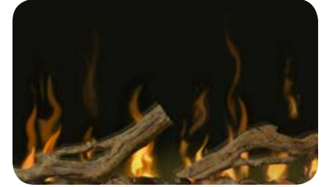
74" Driftwood and River Rock Accessory Package (LF74DWS-KIT)