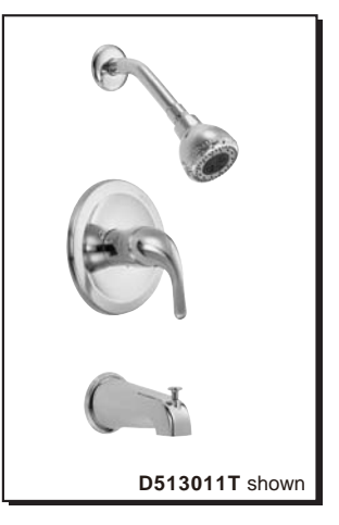
Finishes Available • Chrome

Energy Policy Act of 1992 ASME A112.18.1M ADA Accessibility Guidelin