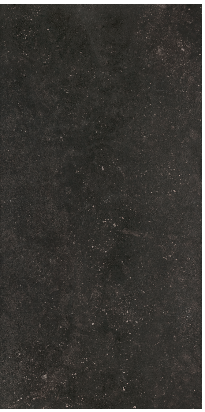
DARK GREY DP03