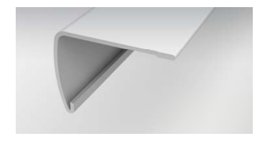
Extra Tall Stair Nose

Low profile end cap used to transition from flooring to carpet, masonry, sliding doors, and other exterior door jambs.