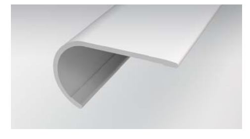
Round Stair Nose

Creates a transition to the edge of the step by overlapping the flooring on the back end. Can also be installed flush on floors with an overall thickness up to 4 mm.*