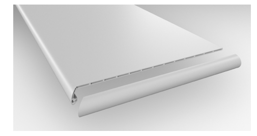
Full Round Stair Tread

Performance Accessories' exclusive 4-in-1 transition allows you to utilize a single transition for four different applications.