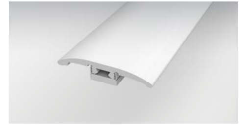
Slim Trim 4-in-1 Transition

Creates a transition to the edge of the step by overlapping the flooring on the back end. Can also be installed flush on floors with an overall thickness up to 4 mm.*