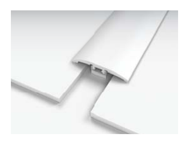
T-Molding Used to transition between

flooring of equal heights and in doorways.