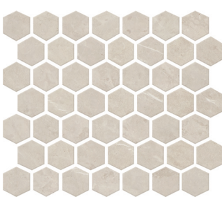
DYNAMIC BEIGE RL21