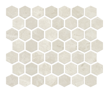
VITALITY WHITE RL20