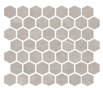
STAMINA GREY RL23