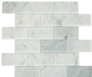
MARBLE WHITE CARRARA M701