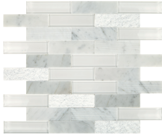
GLASS & MARBLE WHITE CARRARA SK16