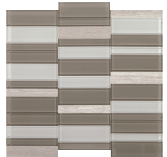
GLASS & LIMESTONE CHENILLE WHITE SK13