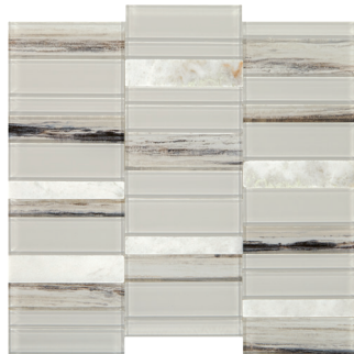
GLASS & MARBLE DAPHNE WHITE SK10