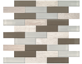
GLASS & LIMESTONE CHENILLE WHITE SK17