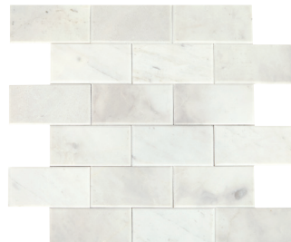
MARBLE STORMY MIST M048