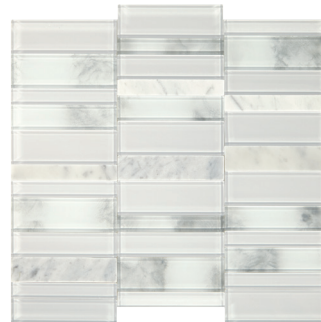
GLASS & MARBLE STORMY MIST SK11