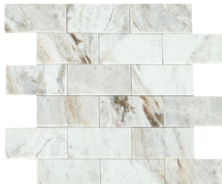
MARBLE DAPHNE WHITE M103