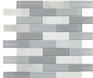
GLASS & MARBLE STORMY MIST SK15