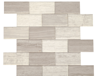
LIMESTONE CHENILLE WHITE L191