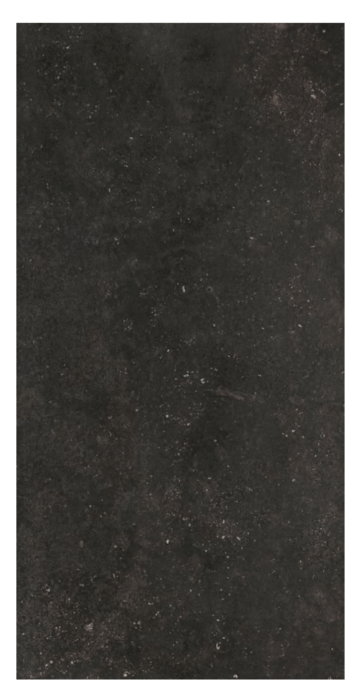
DARK GREY DP03