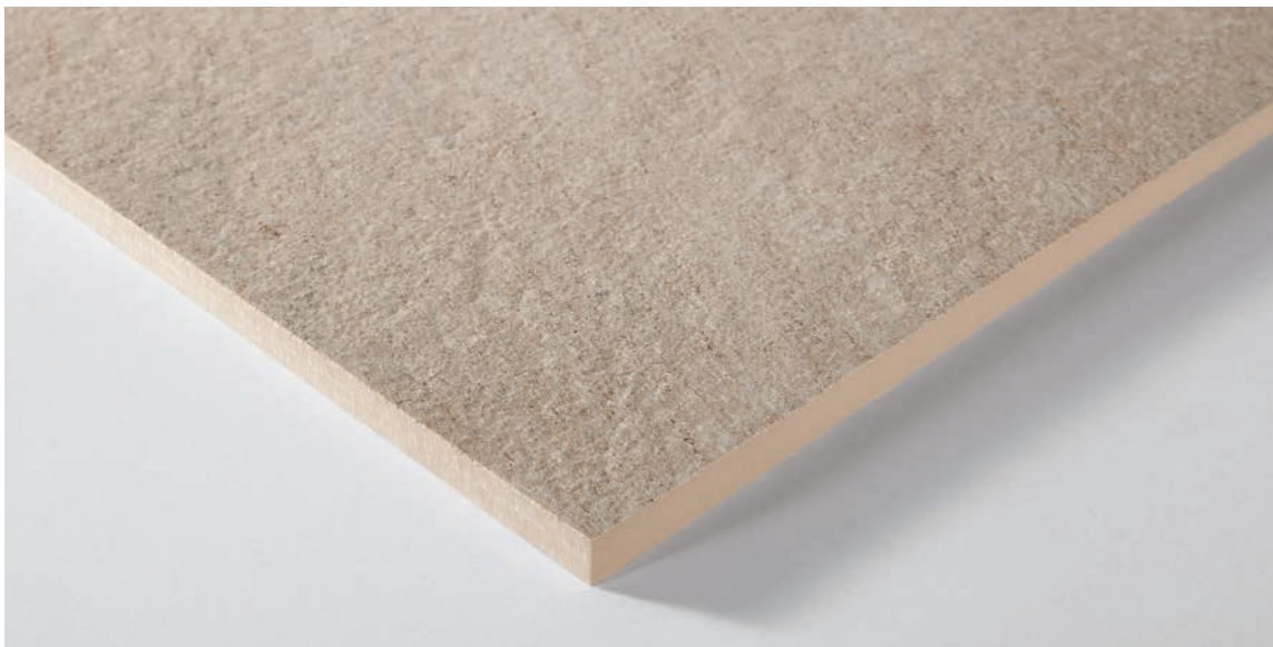
20 mm slab

To prevent possible injury from tile collapse on higher pedestal applications an anti-fragmentation membrane or other similar systems are available.