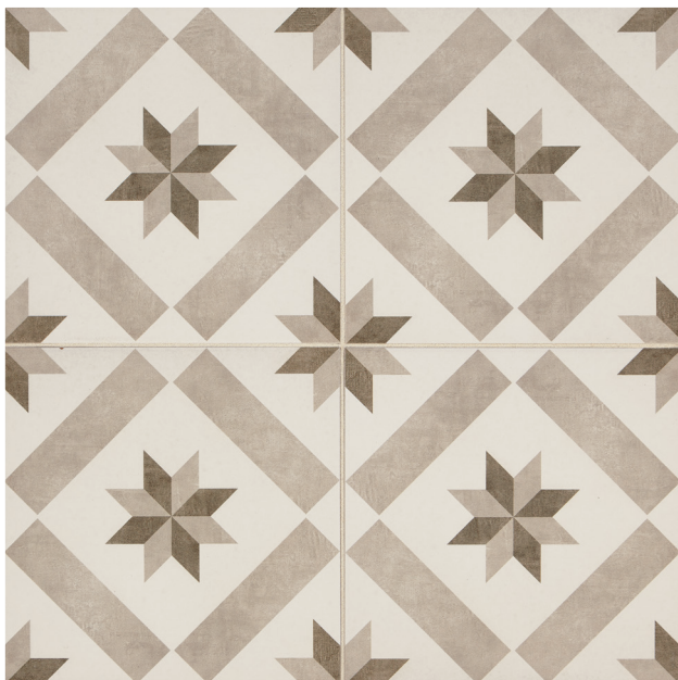
STAR GREIGE ME22