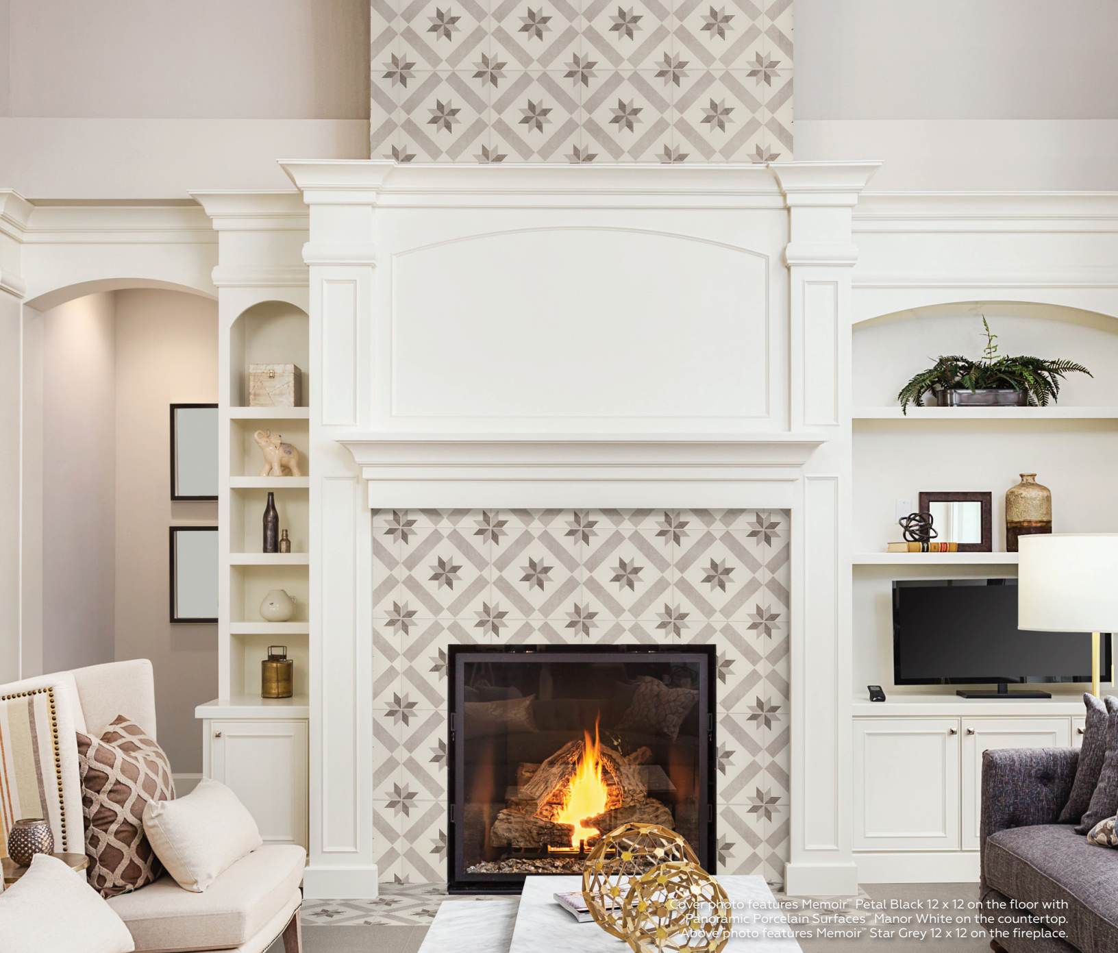
Cover photo features Memoir™ Petal Black 12 x 12 on the floor with Panoramic Porcelain Surfaces™ Manor White on the countertop. Above photo features Memoir™ Star Grey 12 x 12 on the fireplace.