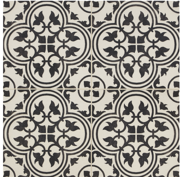
PETAL BLACK ME21