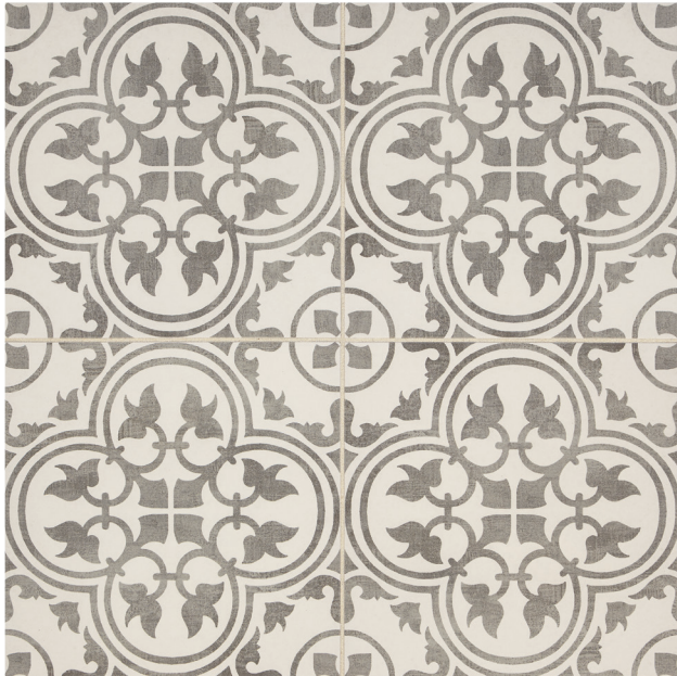
PETAL GREY ME20