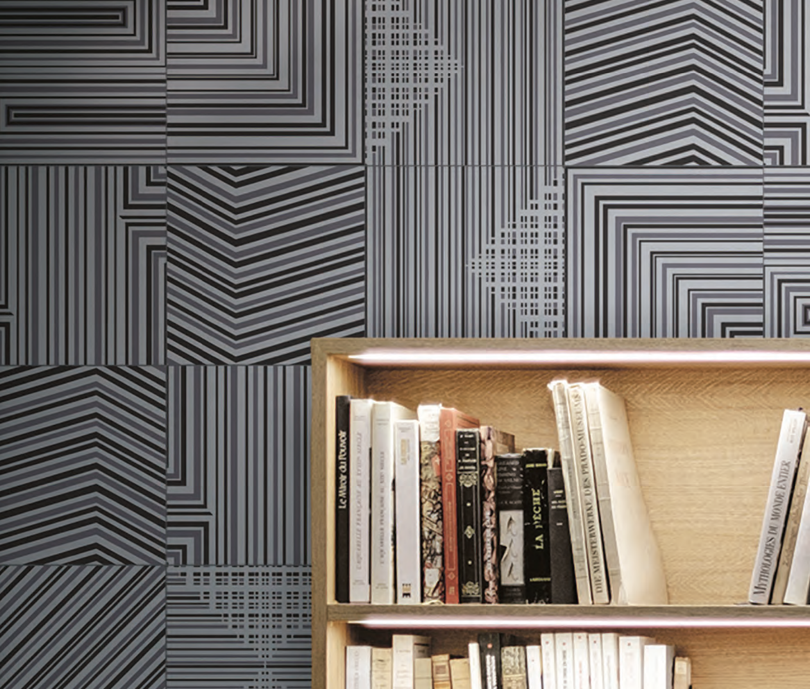
Cover and above photos feature Geometric Fusion™ Graphite 8 x 8 on the wall.