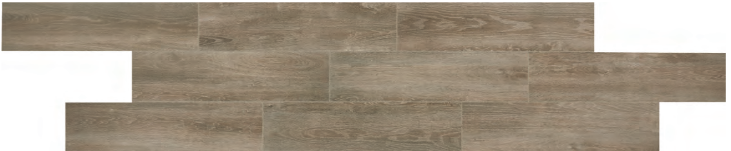
NATURAL ASH TR21