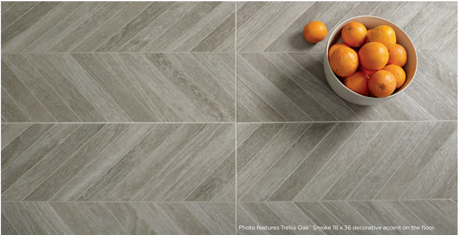
Photo features Trellis Oak™ Smoke 18 x 36 decorative accent on the floor.