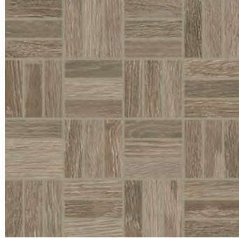
NATURAL ASH TR21