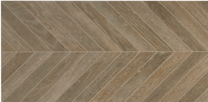
BROWN BLEND TR24