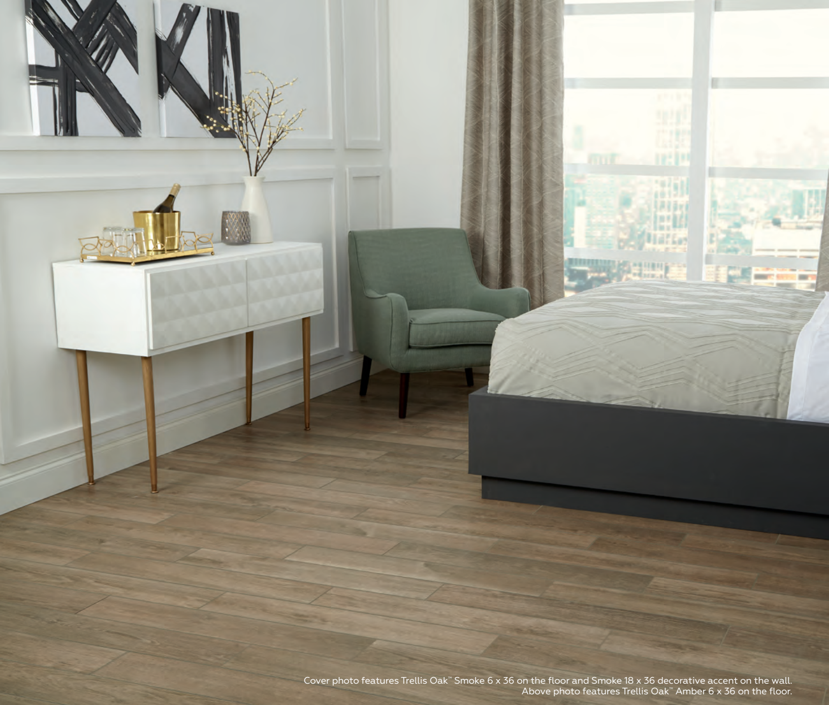
Cover photo features Trellis Oak™ Smoke 6 x 36 on the floor and Smoke 18 x 36 decorative accent on the wall. Above photo features Trellis Oak™ Amber 6 x 36 on the floor.