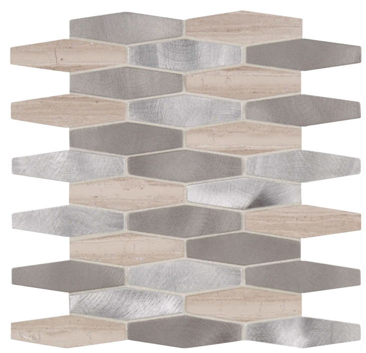
ENDLESS REVERIE IM06