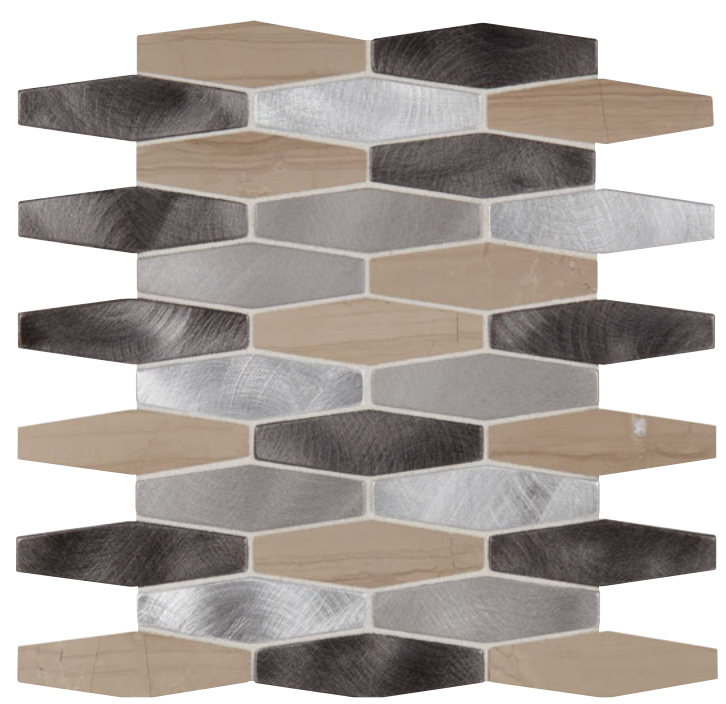
FOREVER AURA IM07