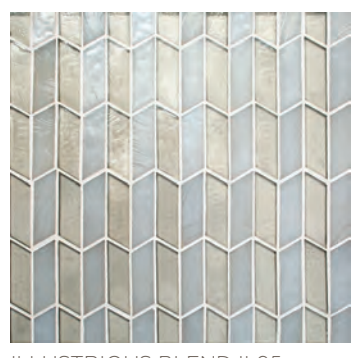
ILLUSTRIOUS BLEND IL95