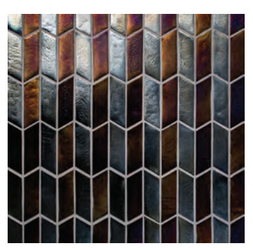
KINDLE BLEND IL92