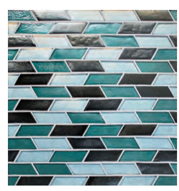
TOPIARY BLEND IL98