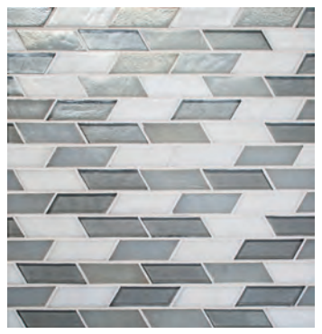
WHISPER BLEND IL99