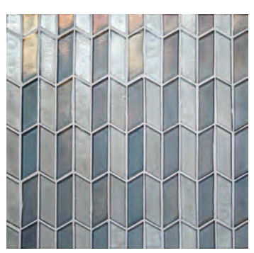
SERENATA BLEND IL93