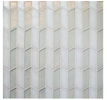
WISP BLEND IL94