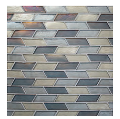
RADIANCE BLEND IL97