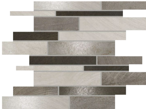
GREY BLACK IC17