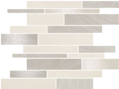
PHOSPHOR GREY IC16