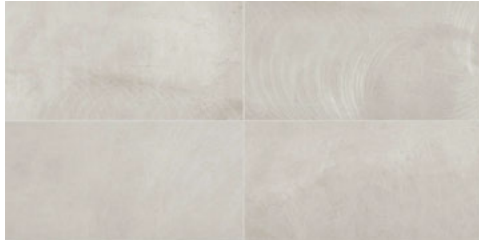
CASPER GREY IC12