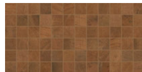
RUSTED BRONZE IC14