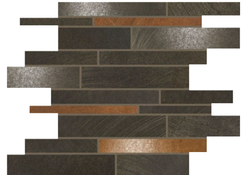
SABLE BRONZE IC18