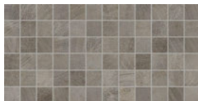
CHARCOAL GREY IC13