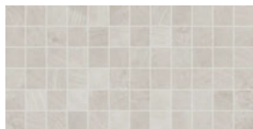
CASPER GREY IC12