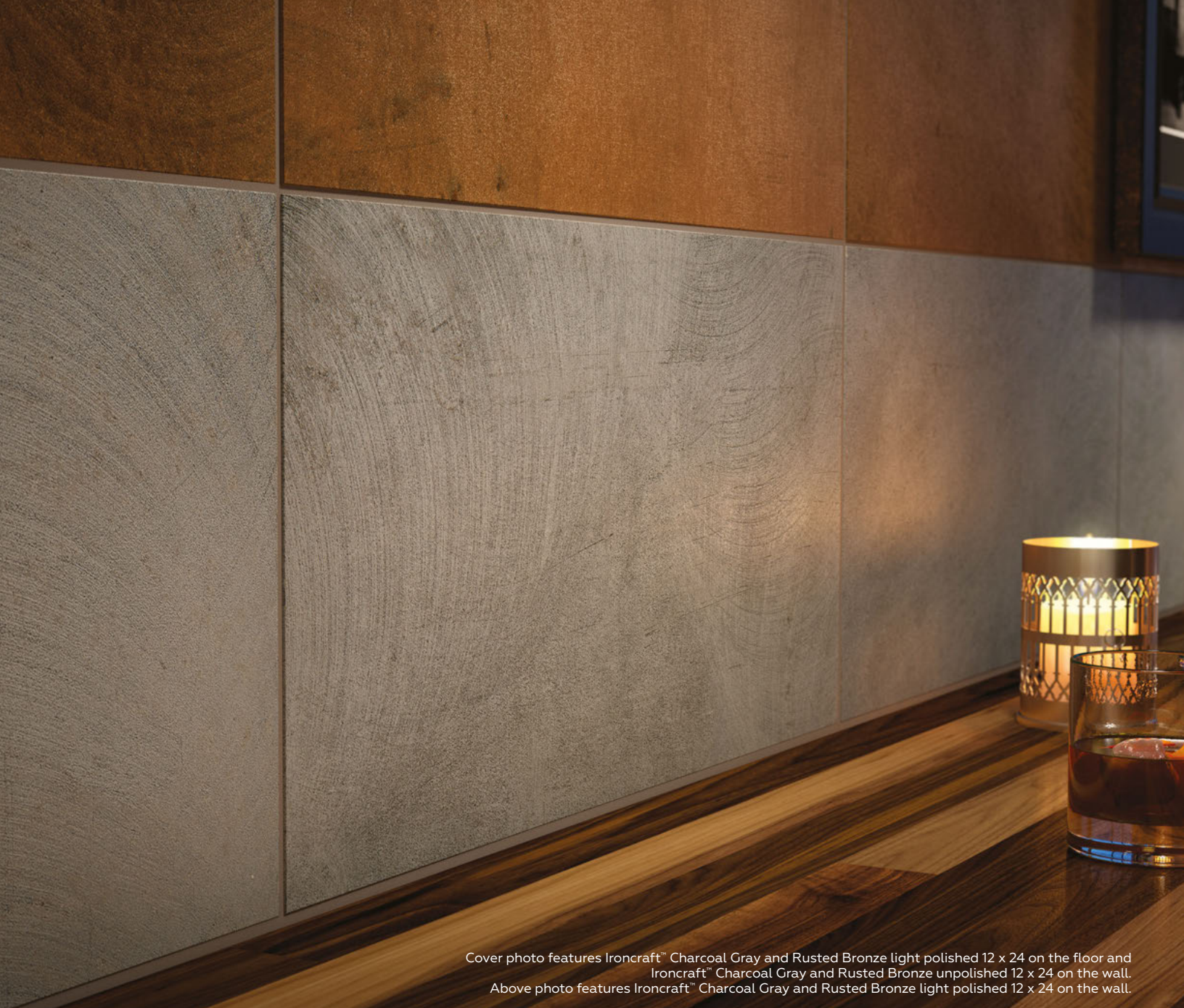
Cover photo features Ironcraft™ Charcoal Gray and Rusted Bronze light polished 12 x 24 on the floor and Ironcraft™ Charcoal Gray and Rusted Bronze unpolished 12 x 24 on the wall. Above photo features Ironcraft™ Charcoal Gray and Rusted Bronze light polished 12 x 24 on the wall.