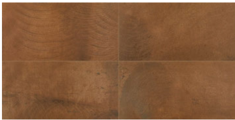
RUSTED BRONZE IC14