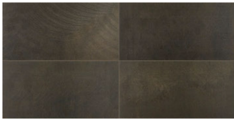
SABLE BLACK IC15