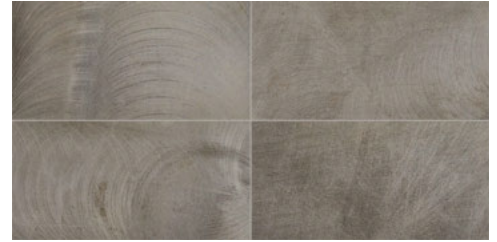
CHARCOAL GREY IC13