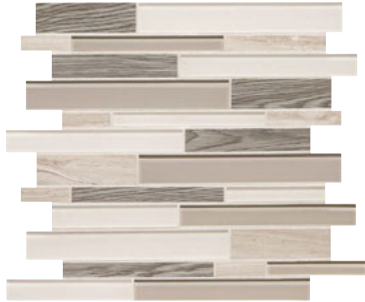
SERENE STORM IB04