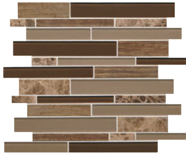
RUSTIC EVE IB03