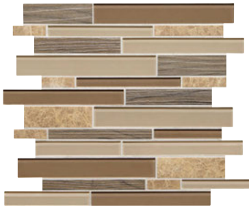
SYLVAN SUNSET IB02