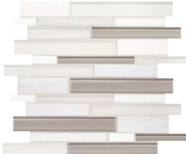
TRANQUIL SNOW IB01