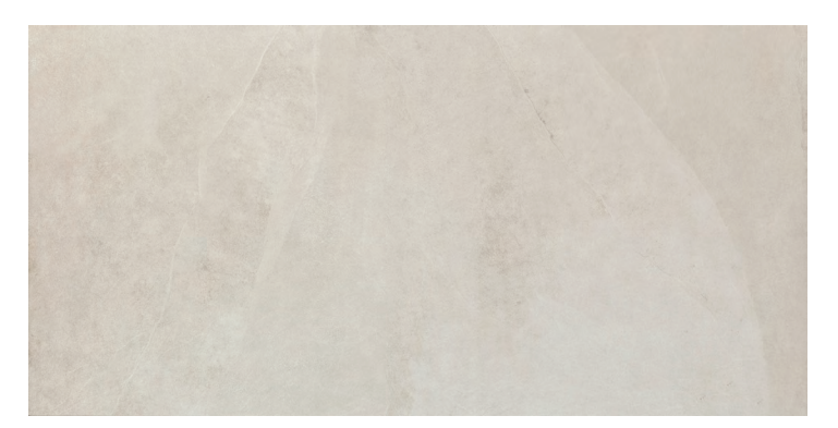
OFF WHITE DL25