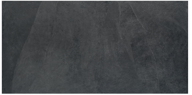
DARK GREY DL27*