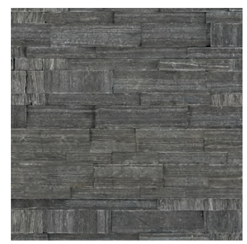
MACAU BLACK S701 6" x 24" Stacked Stone Natural Cleft Ungauged