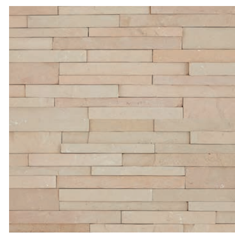
EASTERN SAND S319 6" x 24" Stacked Stone Natural Cleft Ungauged