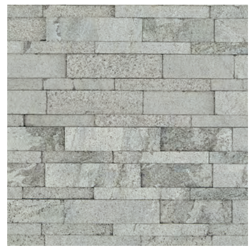
HAIKOU GREY S703 6" x 24" Stacked Stone Natural Cleft Ungauged