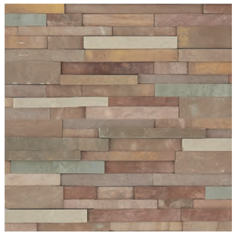
DYNASTY MOUNTAIN S318 6" x 24" Stacked Stone Natural Cleft Ungauged