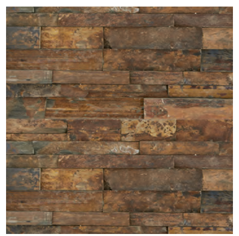
TIBETAN SLATE S317 6" x 24" Stacked Stone Natural Cleft Ungauged