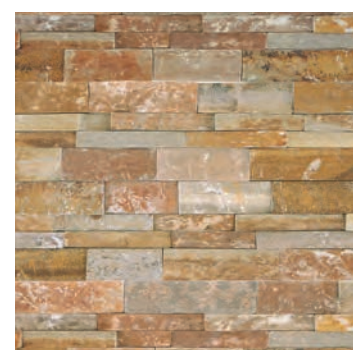
SHANGHAI RUST S349 6" x 24" Stacked Stone Natural Cleft Ungauged