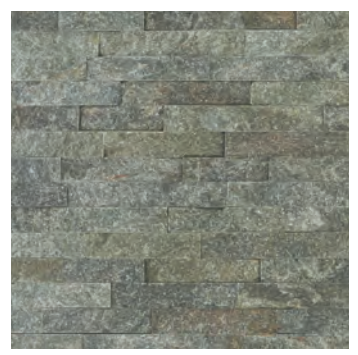
BEIJING GREEN S282 6" x 24" Stacked Stone Natural Cleft Ungauged