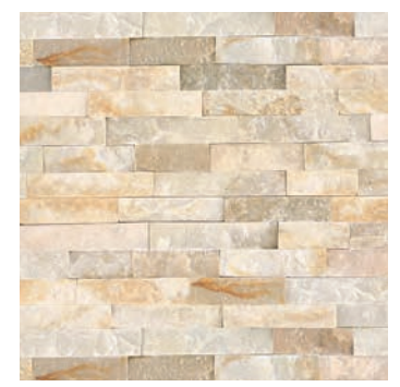
GOLDEN SUN S783 6" x 24" Stacked Stone Natural Cleft Ungauged