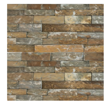
IMPERIAL FALLS S316 6" x 24" Stacked Stone Natural Cleft Ungauged