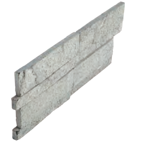
6H x 8L/6H x 15-1/2L Stacked Stone Corner