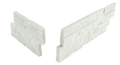
6H x 8L/6H x 15-1/2L Stacked Stone Corner