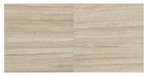
FEATURE BEIGE AR07