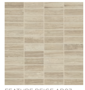
FEATURE BEIGE AR07