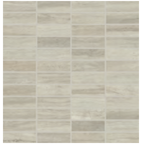
COLUMN GREY AR09