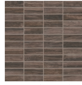
HEADLINE GREY AR10