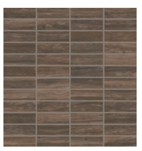
STORY BROWN AR08