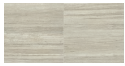
COLUMN GREY AR09