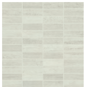
EDITORIAL WHITE AR06