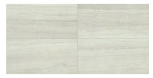
EDITORIAL WHITE AR06