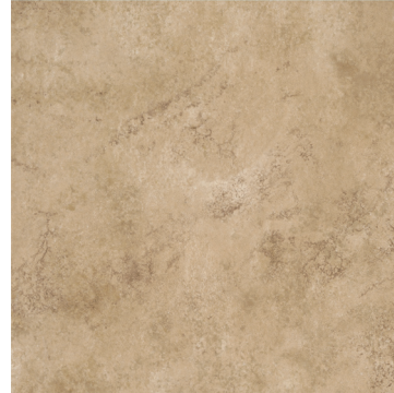
CHATEAU CC72 – 12 x 24 CHATEAU ULMR – 16 x 16 CHATEAU ULMN – 12 x 12