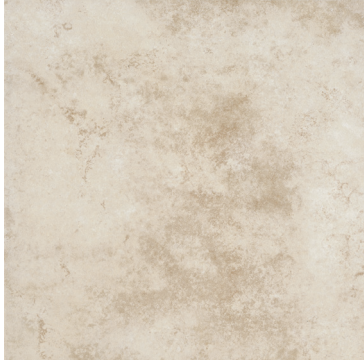
ALPINE CC70 – 12 x 24 ALPINE ULMP – 16 x 16 ALPINE ULML – 12 x 12