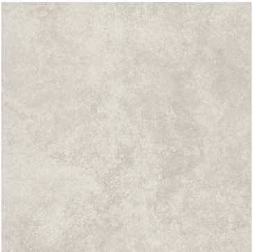
PEDESTAL CC73 12 x 24, 16 x 16 & 12 x 12