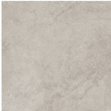
HAZE CC74 12 x 24, 16 x 16 & 12 x 12