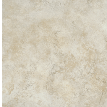
MIST CC71 – 12 x 24 MIST ULMQ – 16 x 16 MIST ULMM – 12 x 12