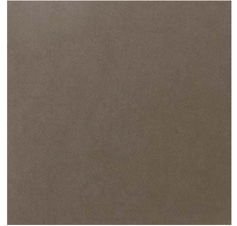
GREEN MIST PN97