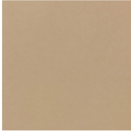
BEIGE HAZE PN95