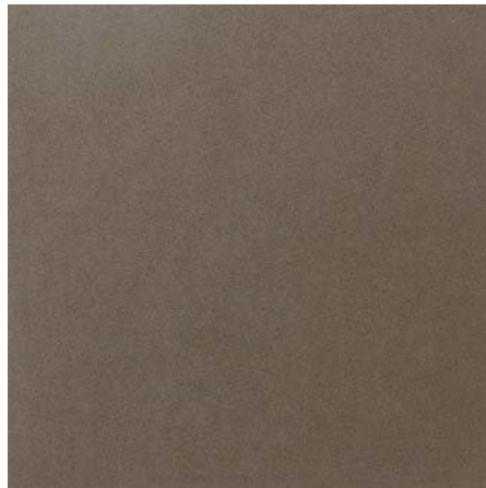
BROWN VISION PN96