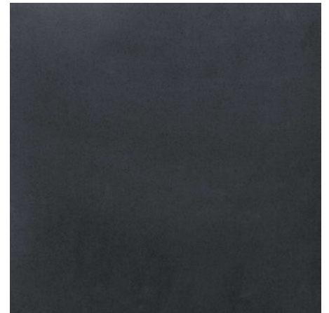
BLACK SHADOW PN99

Elevate Your Space with the Contemporary Design of Plaza Nova